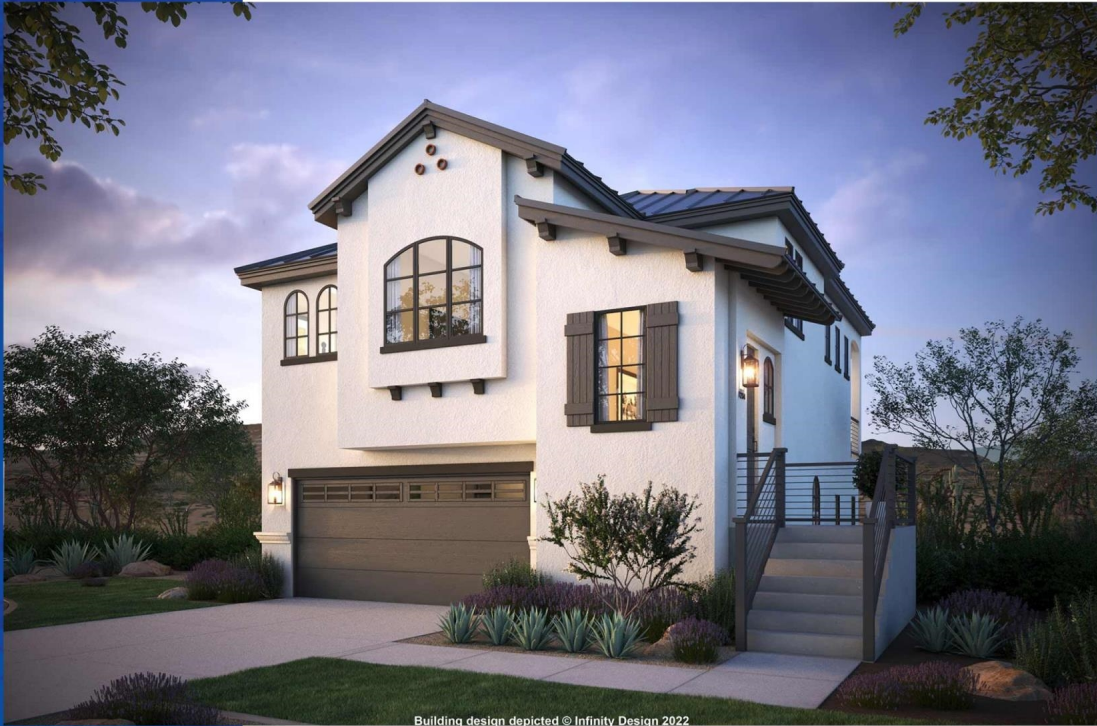
Building design depicted © Infinity Design 2022