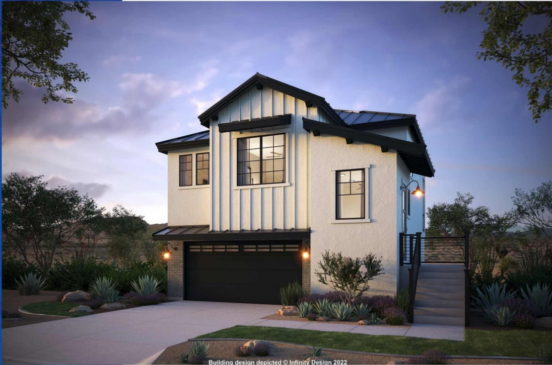
Building design depicted © Infinity Design 2022